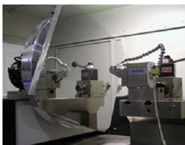
610 mm (24 in.) diameter optic